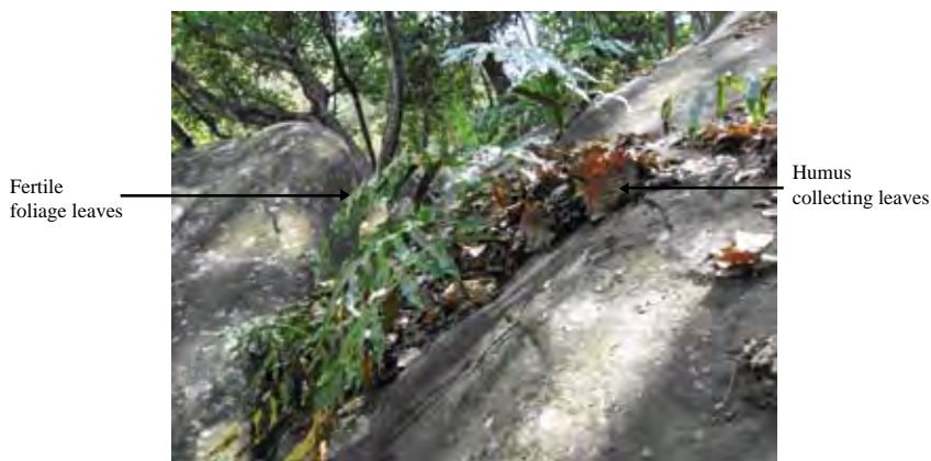
Plate 2: Drynaria sparsisora , on rock around river rine vegetation of the lower Hantana area