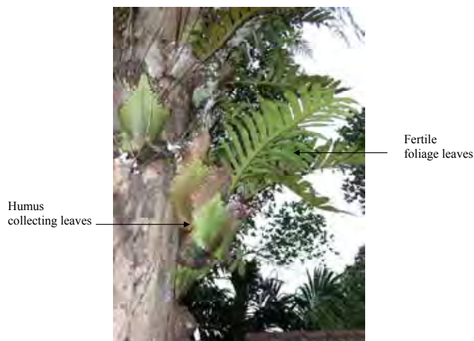
Plate 1: Drynaria quercifolia , on tree trunk of boundary of the Sinharaja forest