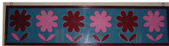
Figure 4: The blossoming child

To represent bigger whole numbers (integers) more places (bits) in the binary number (e.g. 10000001 = 129) are needed. This concept is used every day in storing information in computer hardware. How can we express the concept of binary numbers on a painting? The two digits “1” and “0” can be easily depicted by using two different colors. Let us say “1” is black and “0” is white. This conceptual idea is demonstrated in the following fabric painting “The blossoming child” designed and painted by author in 2004 (Figure 4).