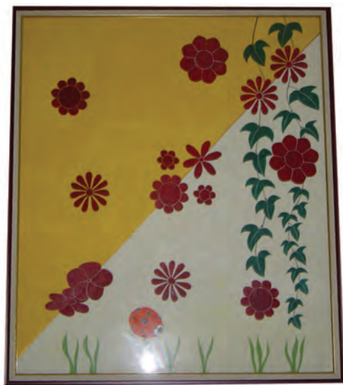
Figure 3: The flower garden

Spectroscopy is a wonderful technique invented by scientists to unravel molecular architecture of simple and complex molecules. A very popular technique used in structure elucidation, is called Nuclear Magnetic Resonance Spectroscopy (NMR Spectroscopy). A common technique of NMR Spectroscopy is called ^1\text{H} - ^1\text{H} COSY, a 2-D NMR technique which allows one to extract information regarding proton connectivity based on spin-spin coupling of neighboring protons. Figure 3 depicts a COSY spectrum of a simple organic molecule in the form of a piece of art (designed and painted by the author in 2005). Those students who have studied