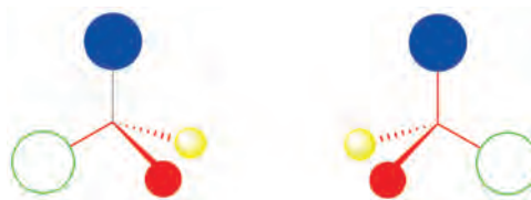
Figure 2: A carbon with four different groups could arrange in space in two different ways